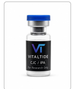
CJC-1295 (No DAC)/ Ipamorelin 10mg - LOT-2026-001