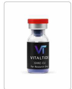
GHK-Cu 50mg - LOT-2026-001