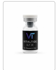
GLP-3R 15mg - LOT-2026-001