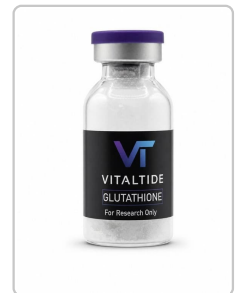
Glutathione 1500mg - LOT-2026-001