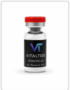
Ipamorelin 10mg - LOT-2026-001