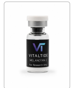
Melanotan II 10mg - LOT-2026-001