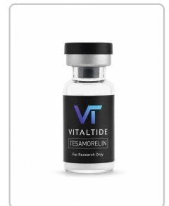
Tesamorelin 10mg - LOT-2026-001